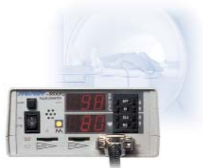
Models 8600FO/8600FOM (only for use with NONIN Fiber Optic Sensors and Cables; accessories available separately)

The 8600FO (or the 8600FOM with optional memory) is designed to meet the unique needs of MRI users for patient safety and image quality. With NONIN's Fiber Optic Sensors and Cables the risk of RF burns is eliminated, as well as the image artifact experienced with some MRI systems and conventional monitors. Use in fixed-site or mobile MRI facilities to monitor infants, pediatrics and adults.