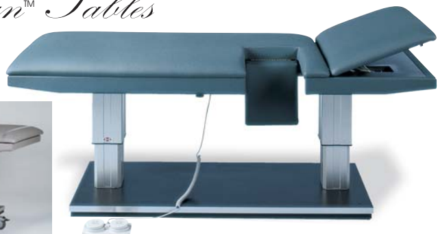
Model 4790 Shown with option 05 - Headrest