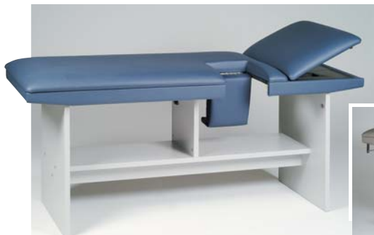
Model 4892 Shown with option 05 - Headrest