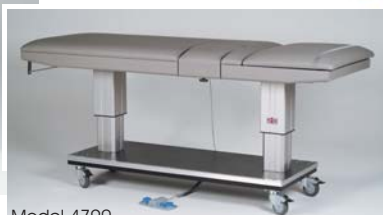
Model 4790 Shown with Options 074 - 4" locking casters, 05 - Headrest, 27 - Paper Dispenser & Cutter